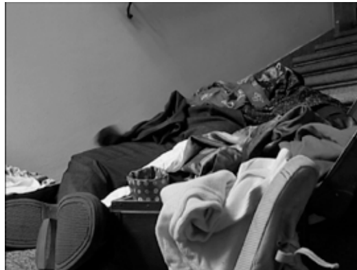
THE SECOND MAN video still

Production: AT 2008/2009. Genre: Experimental narrative