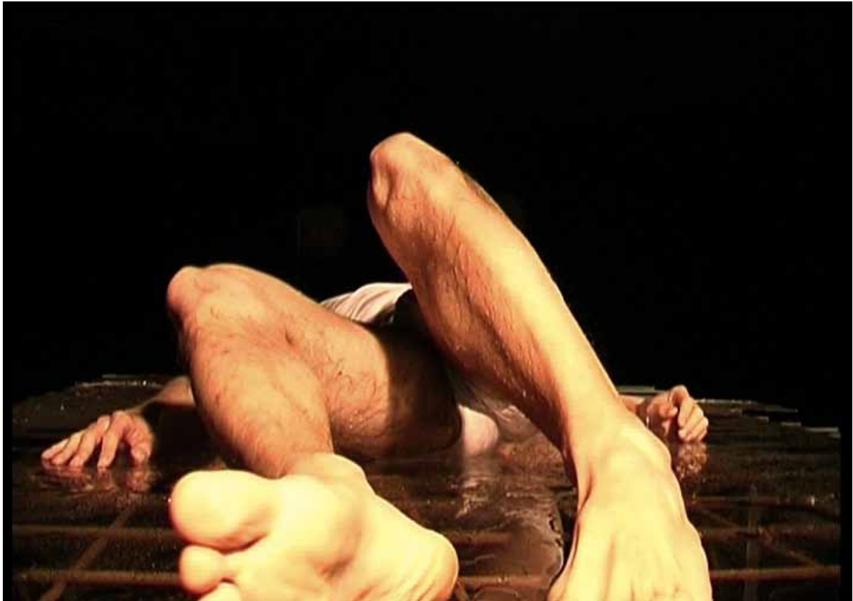
EMBODIMENT video still

Production: NL/AT 2012. Genre: Experimental narrative.