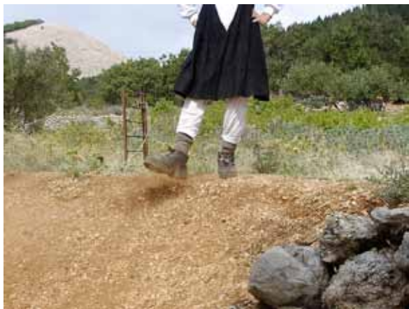
COMEBACK video still

Production: HR/AT 2009. Genre: Experimental narrative.