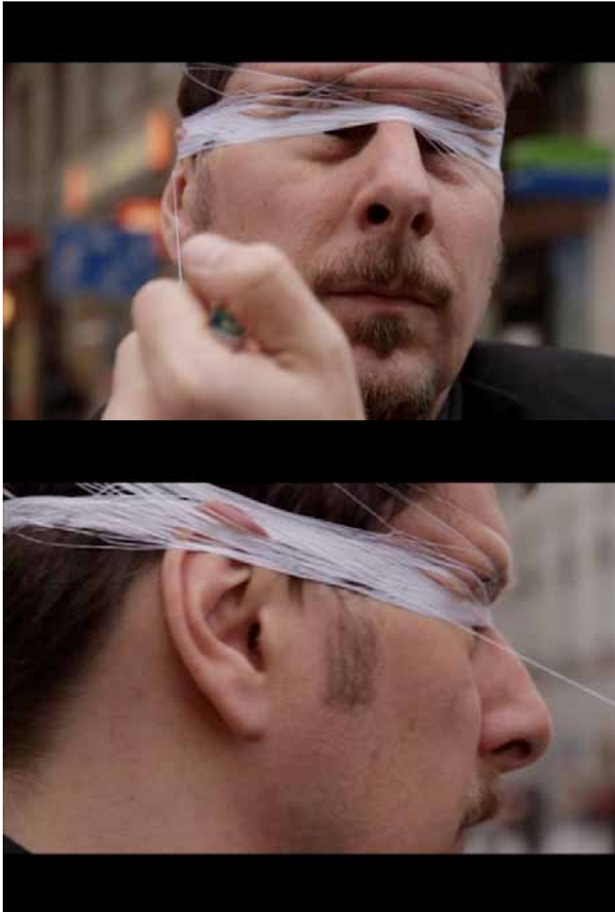
BLIND THROUGH LIFE video still

Production: AT 2011. Genre: Experimental narrative.